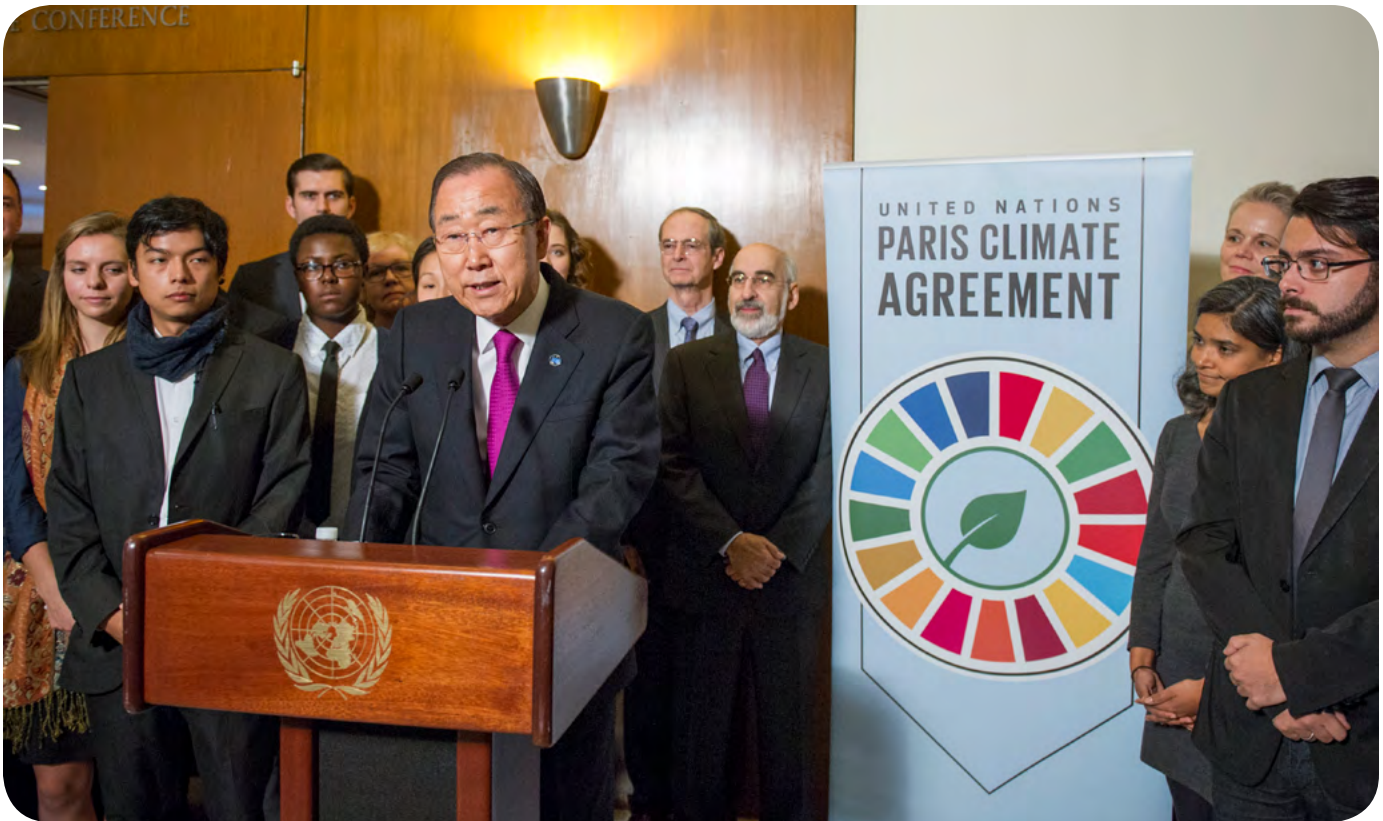
Secretary-General Ban Ki-moon speaks to journalists on the entry into force of the Paris Agreement on climate change.

Within countries, a number of policy processes have been established under these global agendas, elaborating individual commitments, strategies and plans for meeting the objectives therein. These include strategies aimed at achieving the SDGs; National Adaptation Plans (NAPs) and Nationally Determined Contributions (NDCs) under the Paris Agreement; and DRR strategies under the Sendai Framework. These represent key national policy processes that can advance climate-resilient development by facilitating systematic consideration of climate change in decision-making (United States Agency for International Development, 2014). Alignment of these different processes can increase coherence, efficiency and effectiveness towards development outcomes that are resilient and sustainable (Bouyé, Harmeling & Schulz, 2018; Hammill & Price-Kelly, 2016, 2017; UNFCCC, 2017).