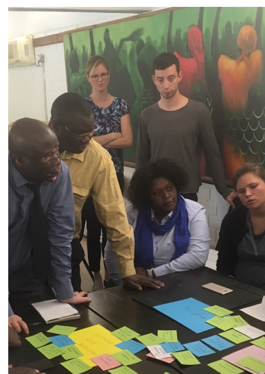
Participants at a FRACTAL engagement in Lusaka, Zambia, play a game designed to create a shared understanding of common terms used by climate scientists, social scientists and city planners.