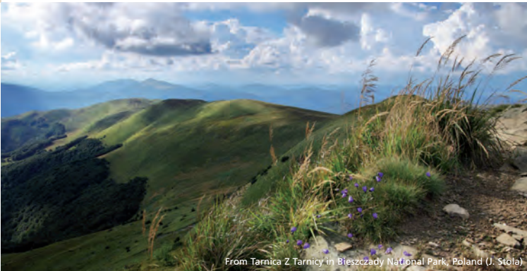
From Tarnica Z Tarnicy in Bieszczady National Park, Poland (J. Stola)