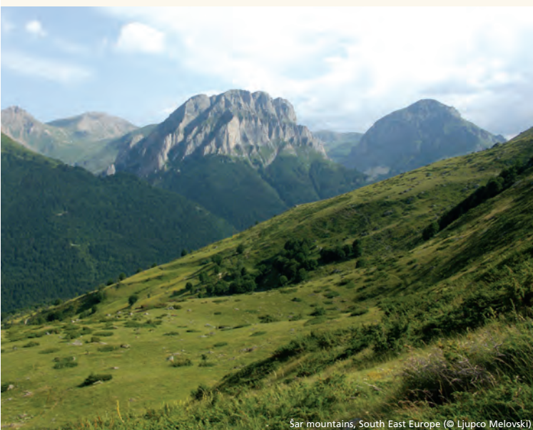
Sar mountains, South East Europe

Both the challenges and opportunities for substantial improvement in all aspects of transboundary and national sustainable mountain development are enormous, with success stories leading to increased regional collaboration and stability. As the European and global experience show, the challenges of sustainable mountain development cannot be effectively solved without intergovernmental cooperation. As an example, in the Carpathian region, international cooperation within the Framework Convention on the Protection and Sustainable Development of the Carpathians provides a solid base for measures to balance environmental protection and sustainable regional development, and to improve the living conditions of the local population.