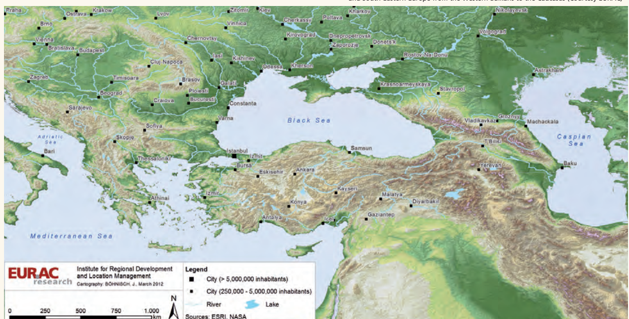
The map below shows the mountains of Central, Eastern, and South-Eastern Europe from the Western Balkans to the Caucasus